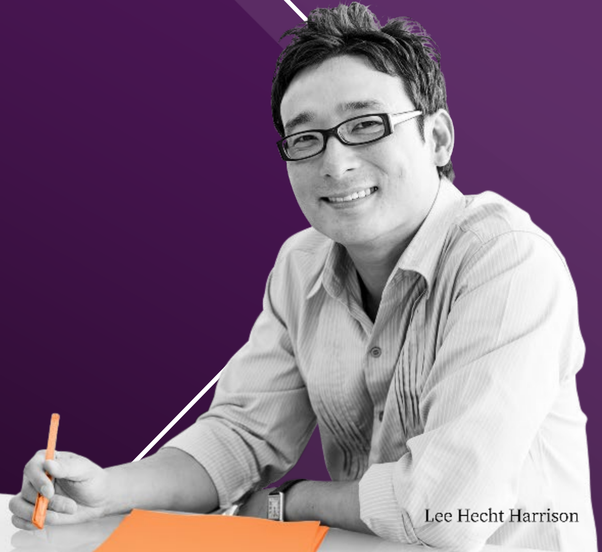
Lee Hecht Harrison

Learn how to develop accomplishment stories for interview/resume/CV